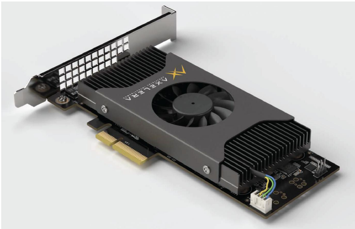
Figure 1: Axelera AI Metis PCIe 1-AIPU AI Accelerator Card module

The Metis PCIe 1-AIPU AI Accelerator Card, (also known as: Metis PCIe 1-AIPU card ) has a single Axelera AI Metis AIPU (AI processing unit) chip and can deliver up to 214 TOPS. It is designed to provide a significant boost for Gen AI and computer vision applications system operating on a PCIe bus. Its performance is enhanced through the Voyager SDK software stack to accelerate application deployment.