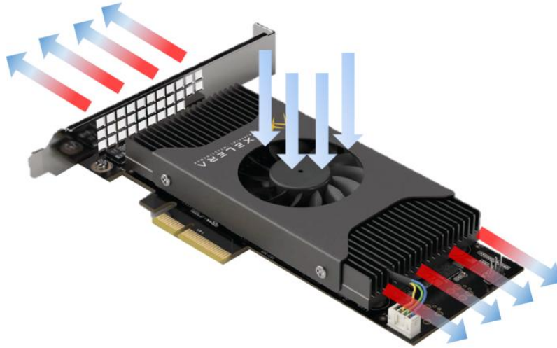
Figure 3: Air flow directions for the Metis PCIe 1-AIPU card with a fan-based cooler.

The Metis PCIe 1-AIPU card uses a fan-based cooler, the fan dissipates hot air on either side of the heatsink. Figure 3 shows the airflow directions: the blue arrow indicates cold air, the red indicates hot air.